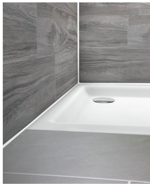
MATTES SILICON, perfect for high-quality matt surfaces.

Wall, floor, ceiling, indoors and outdoors.