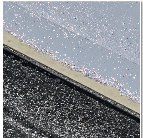
Perfect with MULTIFUNKTIONS-ABDICHTUNG 1K PRO.